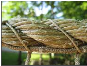
1.25" ProManila lashed to M1250 with #36 Polyester twine