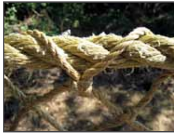
1.25" ProManila woven through P360K