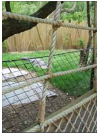
ProManila navy lashed with #84 Polyester twine

Lashing cord is usually matched in color to the border rope.