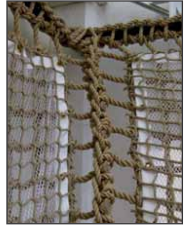
5/8" 3- strand Polyester rope, Netting; N815, DNR800