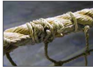
1.25" ProManila lashed to P820K with #36 Polyester twine