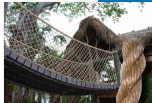
ProManila & P-360K