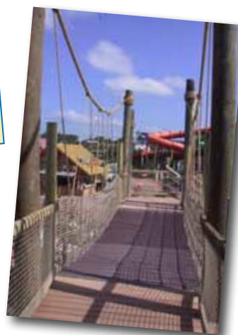
ProManila & M-1250