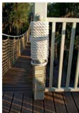
Hand-spliced 3-strand Polyester

InCord's netting and rope products help to create nautical, rustic and natural themes while keeping visitors safe.