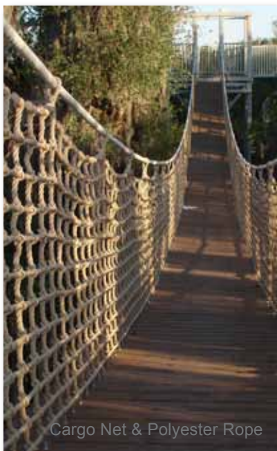
Cargo Net & Polyester Rope