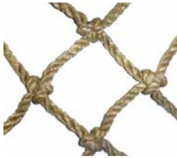
P-360K 3 inch knotted mesh 3/8" diameter Solution Dyed Tan Polyester