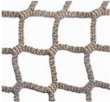
N-815S 1-3/4 inch knotless mesh 3/16" diameter High Tenacity Polypropylene