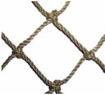
P-820K 2 inch knotted mesh 1/8" diameter Solution Dyed Tan Polyester