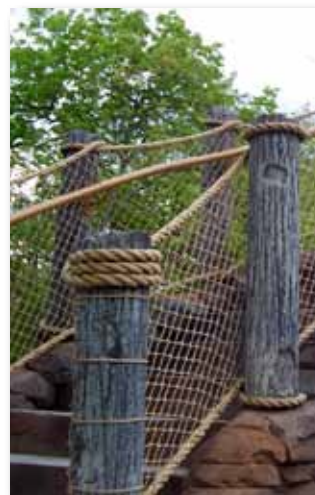
ProManila & P-360K

InCord's netting and rope products help to create nautical, rustic and natural themes while keeping visitors safe.