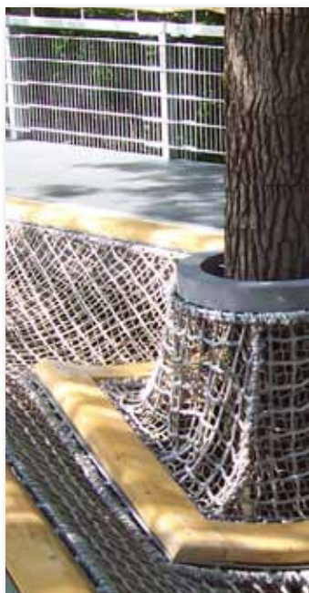
Cargo Net & N-815