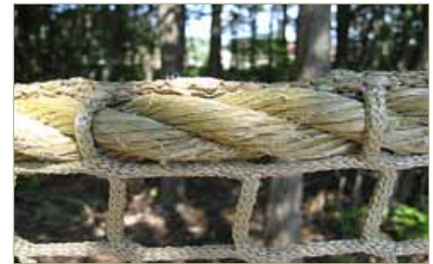
ProManila High Tenacity Polyolefin Fiber Diameters: 1/4", 3/8", 5/8", 1/2", 3/4", 1", 1-1/4"