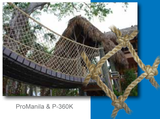
ProManila & P-360K