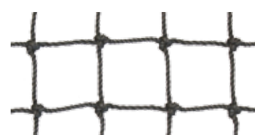
Under-Bed Netting PSN HD 2-1/2 inch Nylon