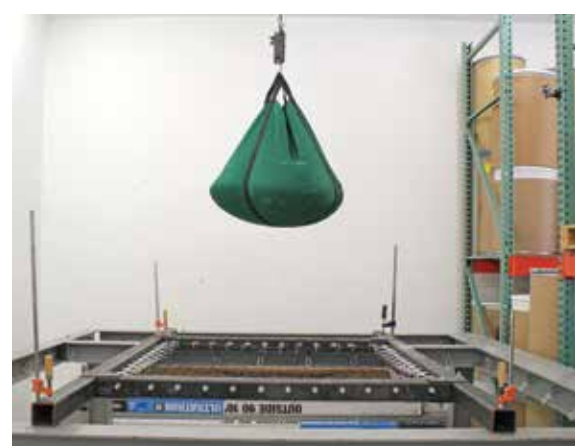
ASTM F2375-09 Class Two (250 lb) drop test