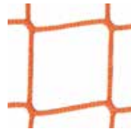
M3000 4 inch

Unlike nylon, the fiber of InCord's M3000 High Tenacity Polypropylene Knotless Netting doesn't stretch, lessening the system's deflection when clearance is limited. A properly installed RSN system can safely and repeatedly arrest a fall within about four feet.